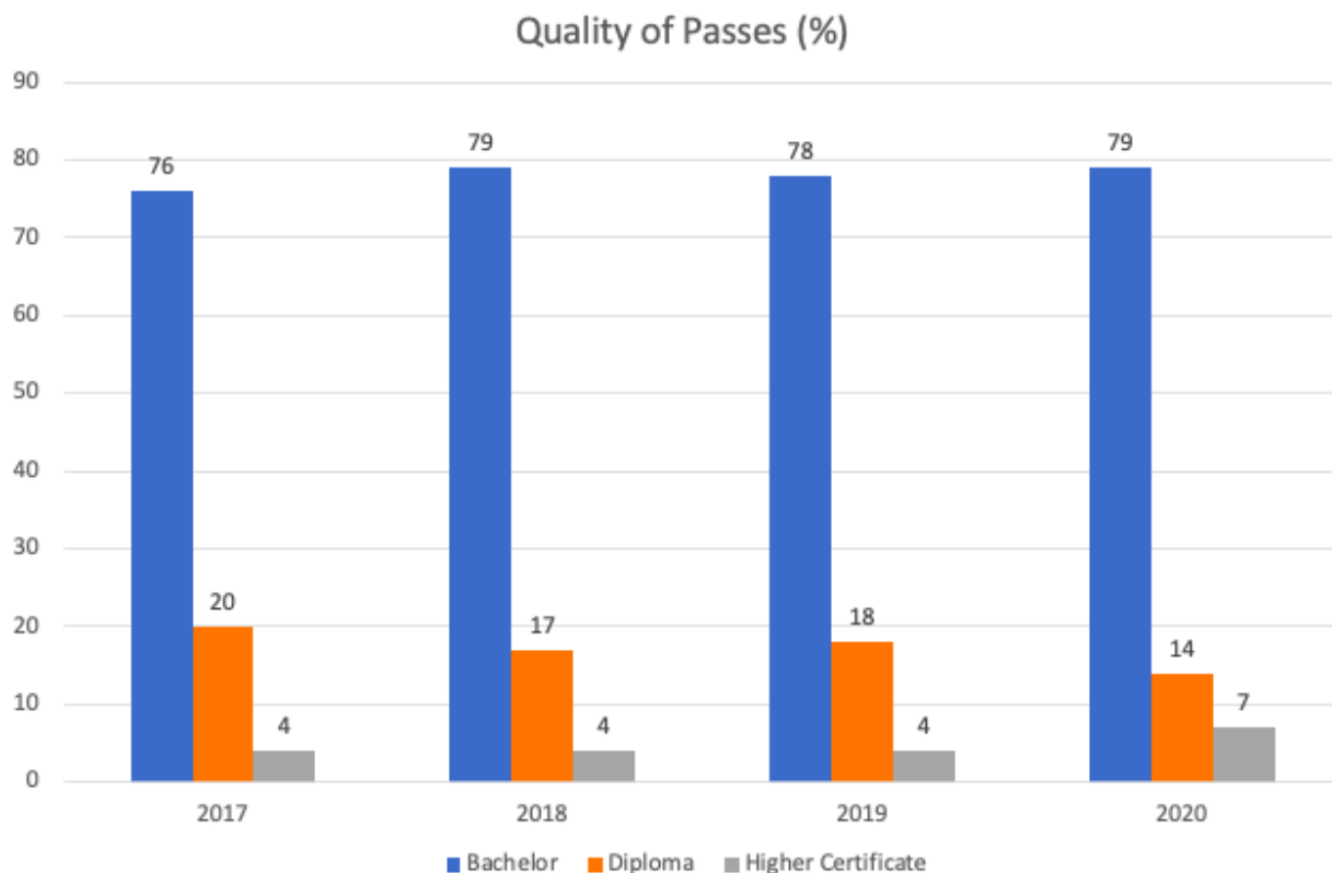
Table 3: Quality of Passes (%)

LEAP's Grade 12 cohort achieved a total of 260 distinctions. This is higher than the number of distinctions recorded as our previous best in 2019 at 242 distinctions achieved. Significant improvements are recorded for Science, Maths, Life Science, Accounting and History.